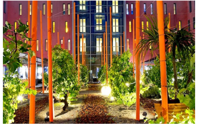
Radisson Blu Hotel