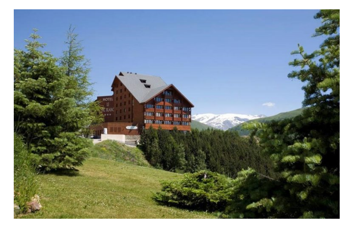
Hotel Pic Blanc