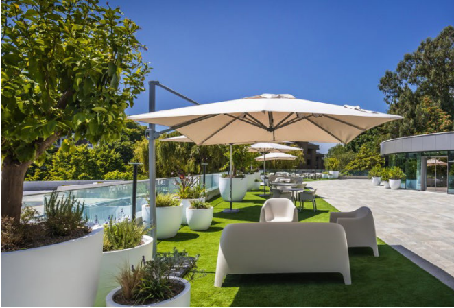
Hotel Barceló Costa Vasca