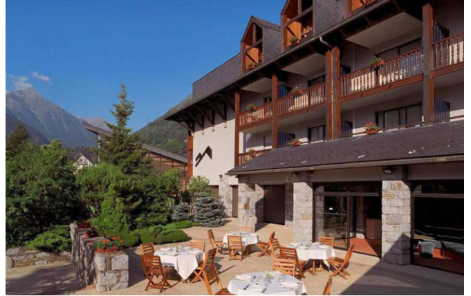
Hotel Mercure, Saint Lary Soulan